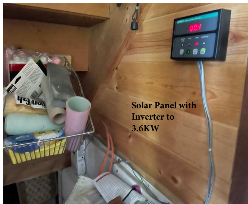
Solar Panel with Inverter to 3.6KW