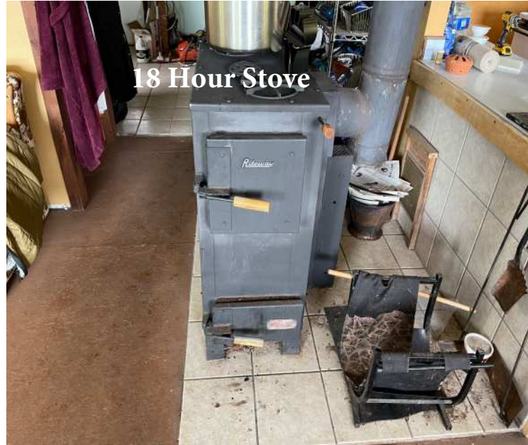
18 Hour Stove