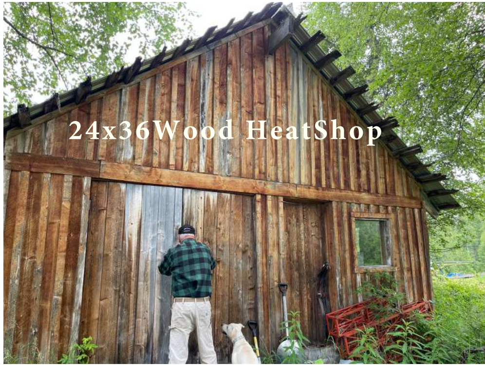
24x36 Wood Heat Shop