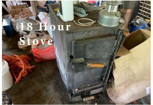
18 Hour Stove