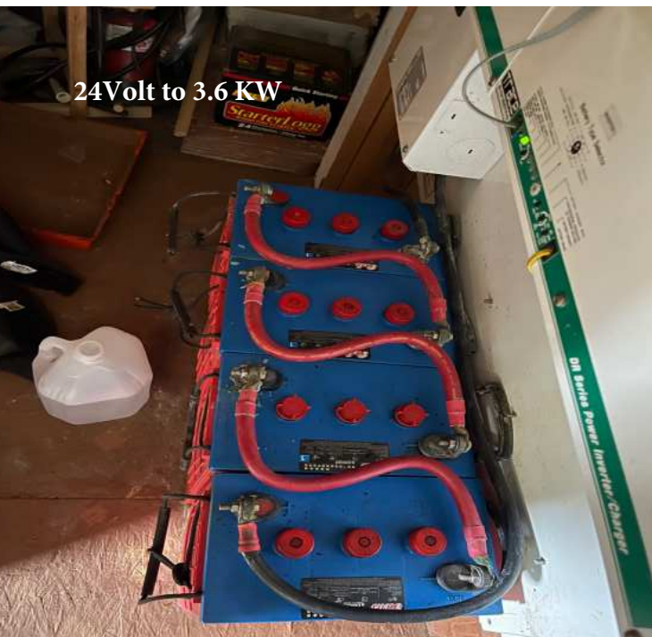
24Volt to 3.6 KW