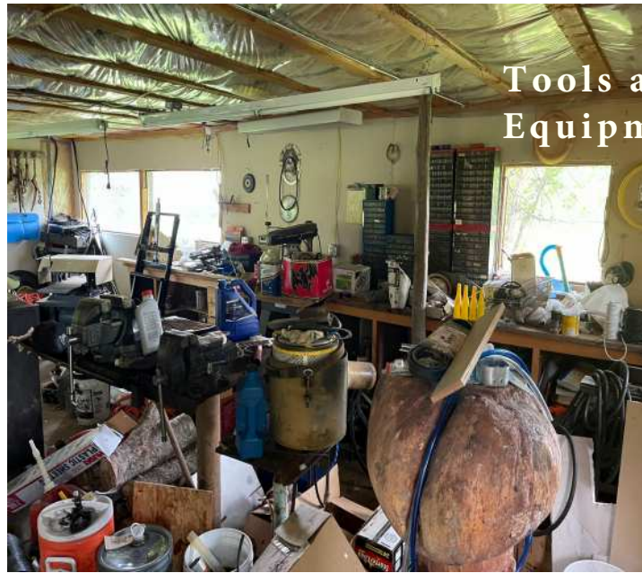
Tools and Equipment Galore