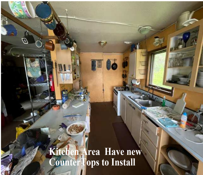
Kitchen Area Have new Counter Tops to Install