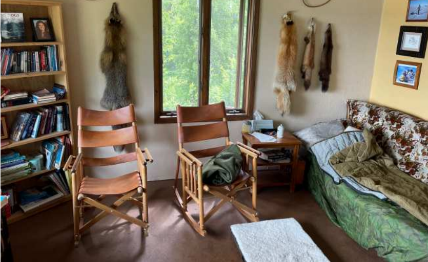
Living Room with Electric and Propane Lights