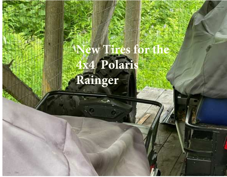
New Tires for the 4x4 Polaris RANGER