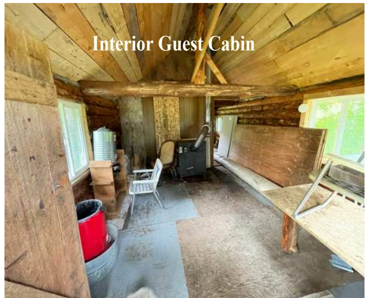
Interior Guest Cabin