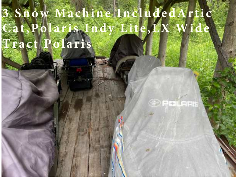
3 Snow Machine Included Artic Cat, Polaris Indy Lite, LX Wide Tract Polaris