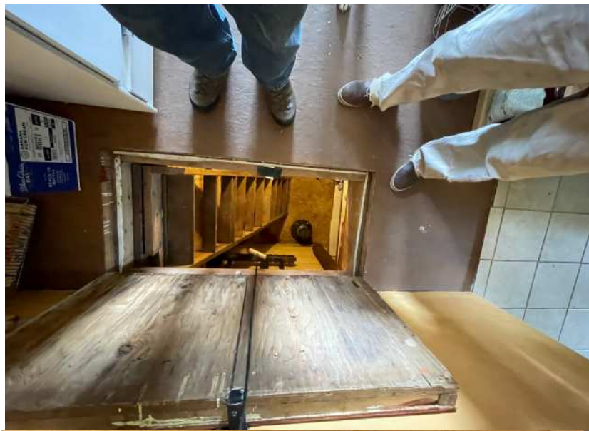
12x12 Root Celler