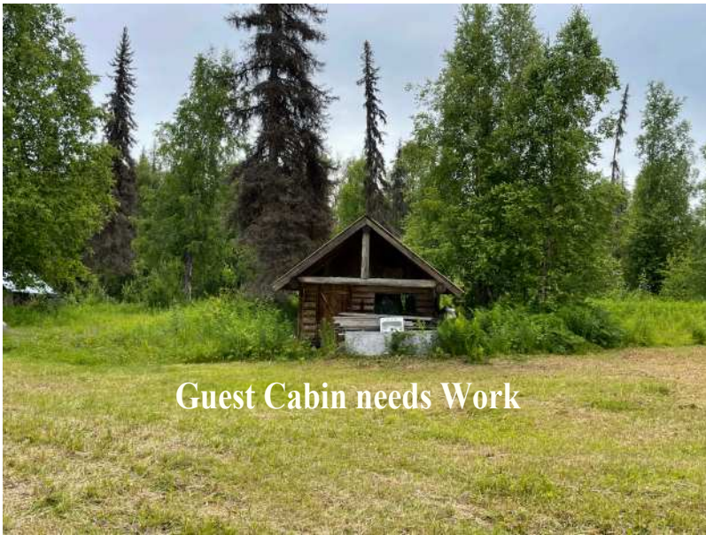
Guest Cabin needs Work